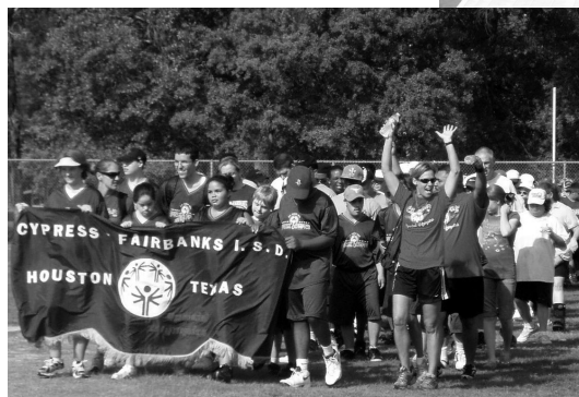
Special athletes take the field with their team flags at the Special Olympics Softball Tournament.

HBA volunteers work the check in table at the Bowling Tournament.