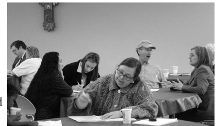
Volunteer attorneys counsel clients from the Texas Medical Center and others at Palmer Memorial Episcopal Church.